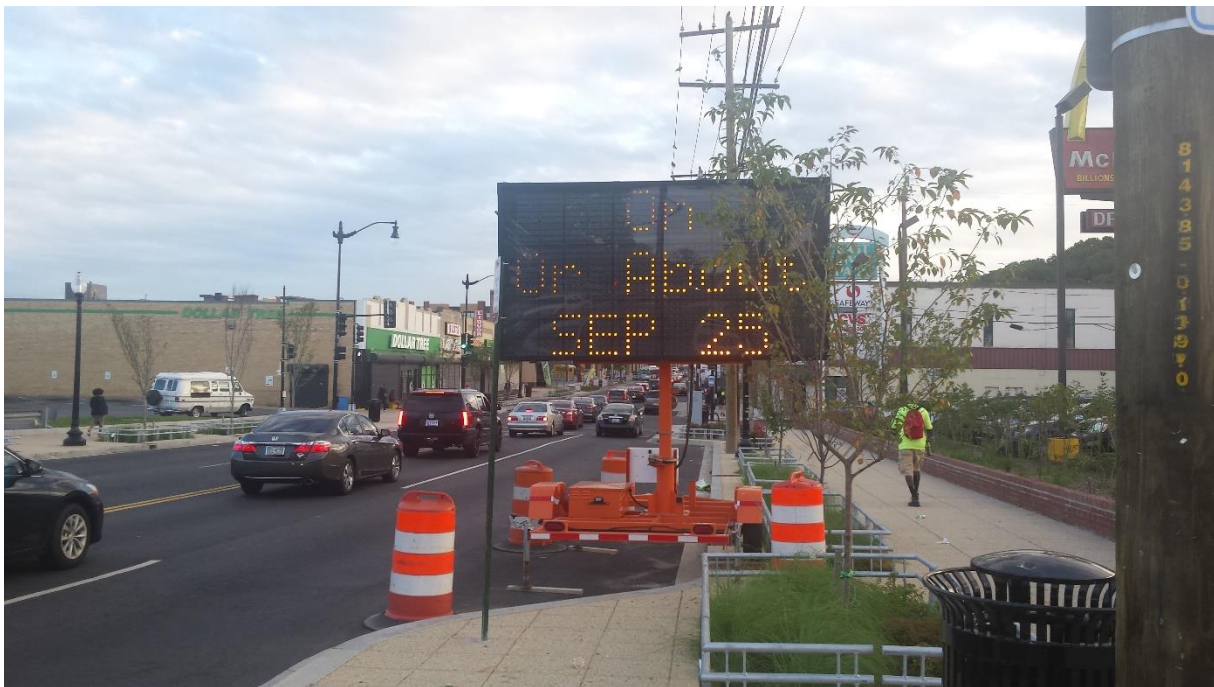
Figure 1 Project VMS Board at Dix Street/Minnesota Avenue NE