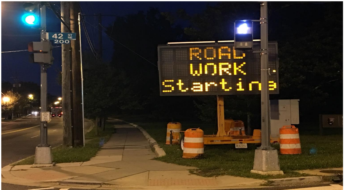
• Figure 4 Through project limit at night to ensure VMS Board is working.